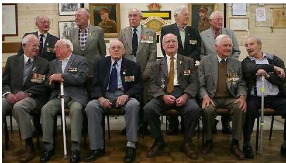
Rats of Tobruk wait for the auction.

Kerry O'Brien the host of the 7.30 Report stated: 'We've had some great outcomes to stories occasionally over the years. This is one of the best, as I'm sure the Rats would agree.'